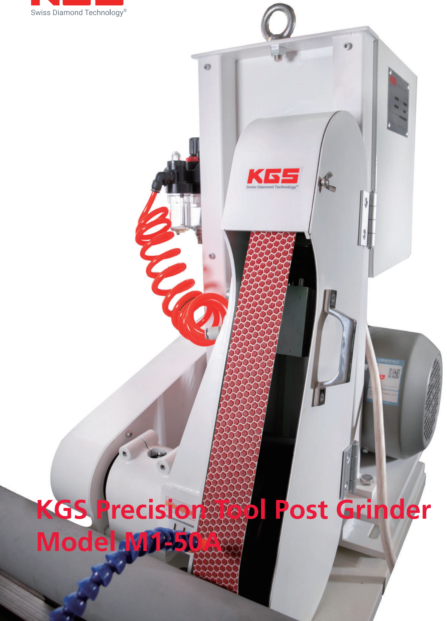
KGS Precision Tool Post Grinder Model M1-50A